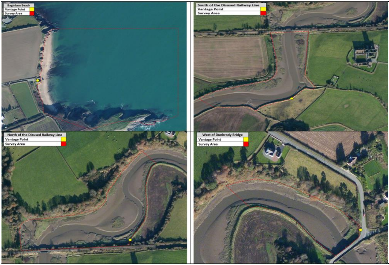
Figure 2: vantage point location for the winter bird counts.